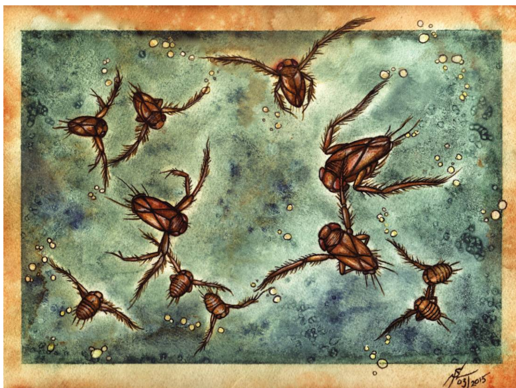
“Vast numbers of Corixidae were living in the water”—G. E. Hutchinson ( The American Naturalist, 1959, 93:145–159).